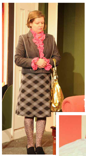
Photos From The Set Of Key For Two