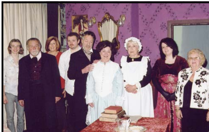
While Over On Channel 4, There Is A Palpable Air Of Tension Among The Housemates In Edwardian Big Brother