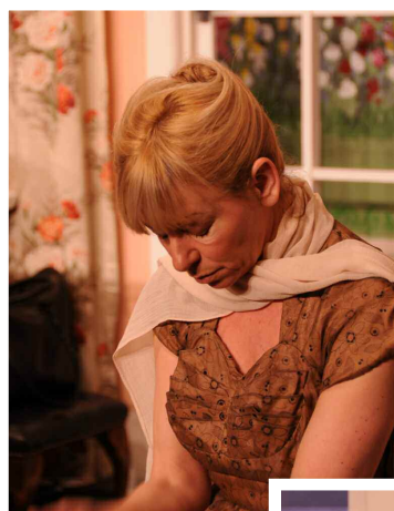
Photos From The Set Of The Chalk Garden