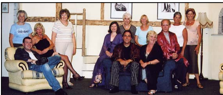
What It Would Like If You Were Inside The TV While The Entire Cast And Crew Were Watching Deal Or No Deal On A Wet Wednesday Afternoon