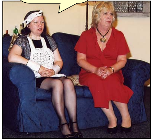
Plans For A Revival Of Upstairs Downstairs Suffer A Setback When Sharon Finds Out She Has Been Cast As Ruby